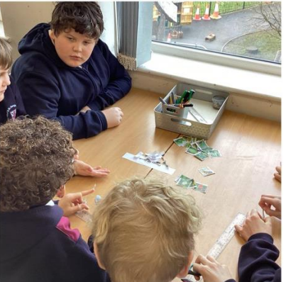
As one child said, "I like it when the teacher explains how they solved a problem because it gives me chance to look inside their head and find out the secret to learning"