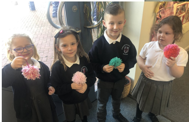
Year 1 Magical Pom Poms