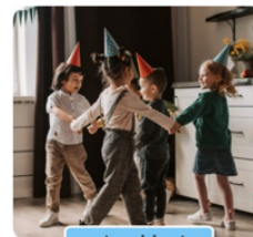
music and dancing

How do you and your family or community celebrate special times?