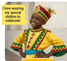
I love wearing my special clothes to celebrate!