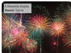
A fireworks display.