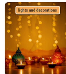
lights and decorations