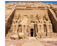
Abu Simbel Temples, Egypt

Why it moved: In 1847, it was moved to make space when Buckingham Palace was expanded. It was taken down and rebuilt by 1851, at its new site near Hyde Park.