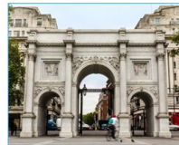
Marble Arch, UK

Look at the resource below, which shares some other buildings that have been moved.