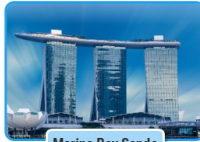
Marina Bay Sands